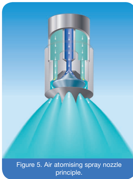
Figure 5. Air atomising spray nozzle principle.

It became clear in the above and specific comparison of the operating costs that the SB system is in favour. However, AA-nozzles are still the only possible solution for many projects where a finer water spray is needed, where the GCT exists and an extension is not possible (no space, foundation limits, etc.) or because the raw mill runs 98% of the time and the high compressed air consumption during 2% running time is acceptable.