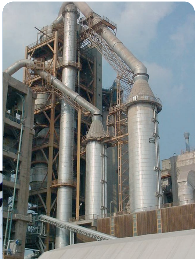
Figure 1. GCT.

SB systems operate at 35 bar at nozzle level. The main operating features of this nozzle is a constant feed pressure and a backflow line to the tank, where the control