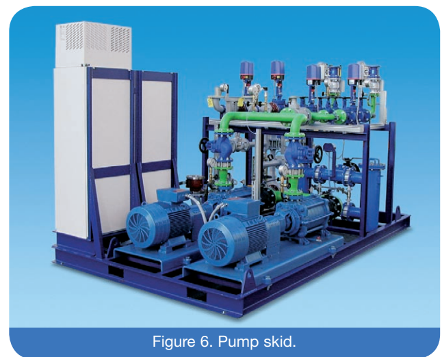
Figure 6. Pump skid.

Only the long term comparison of all costs based on the individual parameters of each cement plant (% mill operation, raw material humidity, energy prices etc.) will give the cement companies a good position to decide for the best system. _____ ●