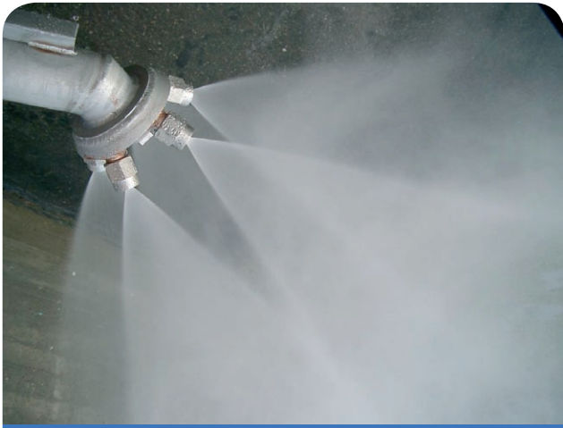
Figure 4. Spillback clusterhead lance.

during mill operation. A second identical back-up-compressor is also installed. Maintenance and running costs for the compressors are high, and the life cycle of the compressors is limited.