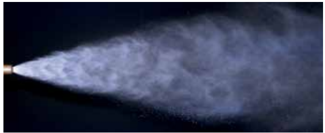
Spray pattern of the MasterNOx nozzle 30°

Adjustment of the droplet spectrum by changing the air/water ratio