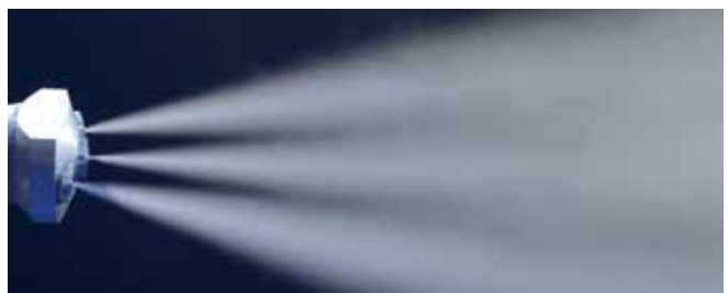
Spray pattern of the 1AW nozzle