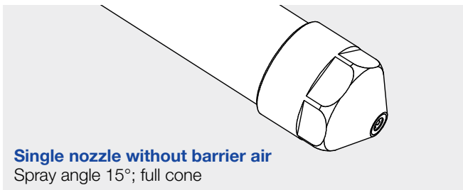
Single nozzle without barrier air Spray angle 15°; full cone

Adjustment of the droplet spectrum by changing the air/fluid ratio