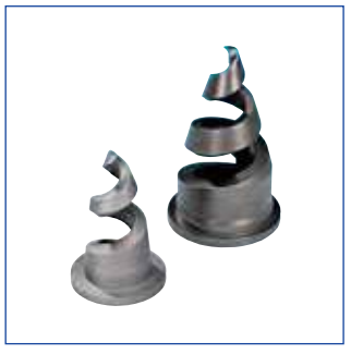
Helix nozzles made of Stellite