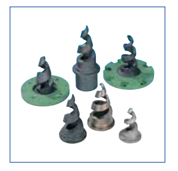
Helix nozzles made of SISIC/ReSIC