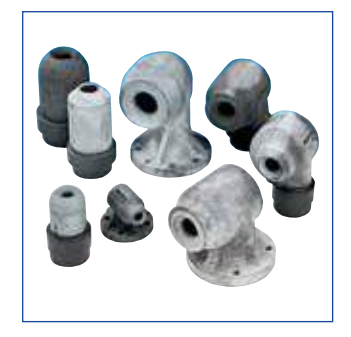
Nozzles made of SIC

Twin4Absorb nozzles are a further development of the Twin-Absorb® nozzle series. Four overlapping spray cones generate additional jet collisions and thus a more active reaction surface. Thanks to the enhance spatial distribution, the Twin4Absorb nozzles are ideal for optimizing existing scrubbers.