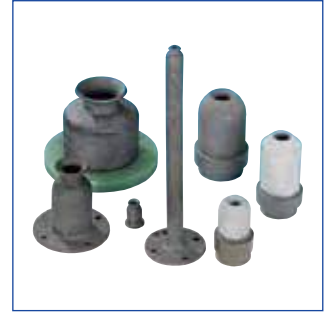
Nozzles made of SISIC